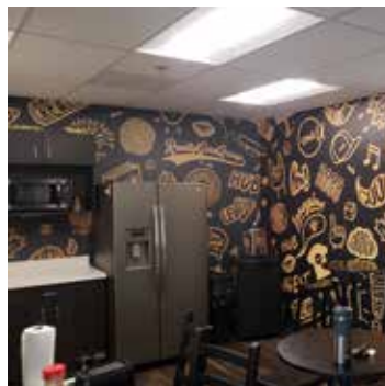
CUSTOM WALL WRAPS